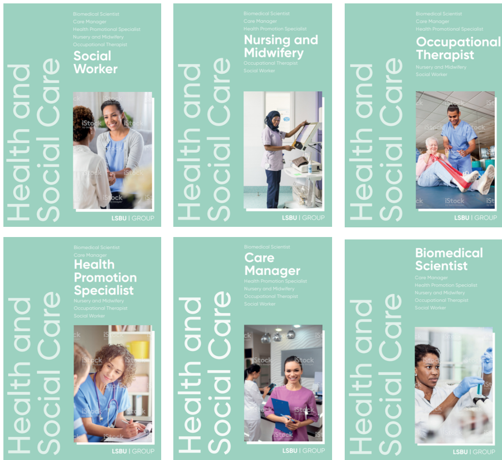
Figure 1. Examples of some of the educational pathways which exist across our Health and Social Care provision